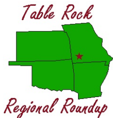
Table Rock Regional Roundup

APPLICATION FOR EXHIBIT SPACE September 27-29, 2018 Big Cedar Lodge, Ridgedale, MO